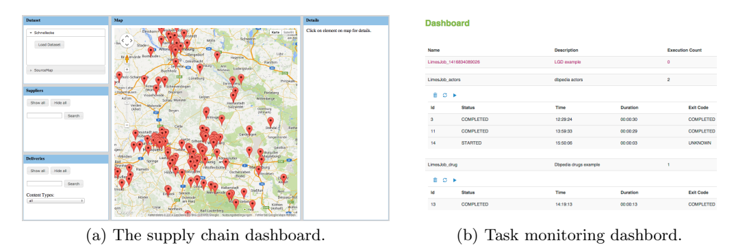
Figure 3: Use Cases and Applications of GeoKnow Generator Workbench

framework created under the EU project COSMODE<sup>9</sup> using components from the LD Stack. This platform requires implementing Data Processing Units for each component in order to be integrated. Moreover, Unifiedviews doesn't provide support for authentication or authorisation features. Still, it represents a relevant reference point for the Geo-Know Generator Workbench. [10] presents a workbench for publishing geospatial linked data. In contrast to our work, the data processing is highly specialized and does not provide solutions for all steps of the LD lifecycle.