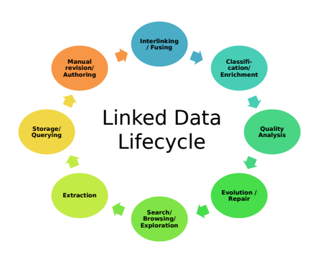
Figure 1: Linked Data Lifecycle

Jens Lehmann Universität Leipzig, AKSW Leipzig (Germany) lehmann@informatik.unileipzig.de